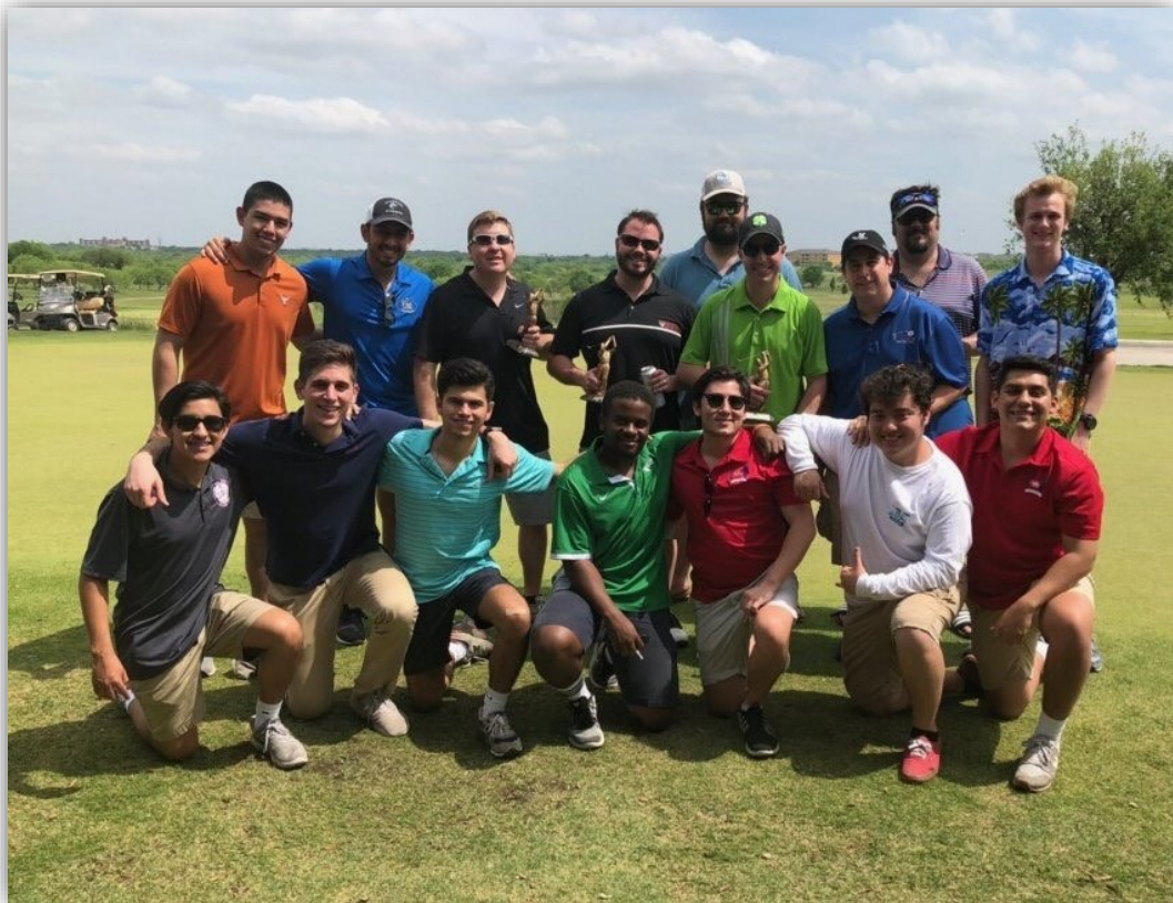
(ALUMNI GOLF TOURNAMENT 2018)